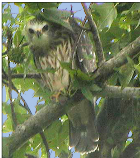
Find the immature Mississippi Kite...

the juvenile was now fully fledged and no longer returning to the nest. Instead,