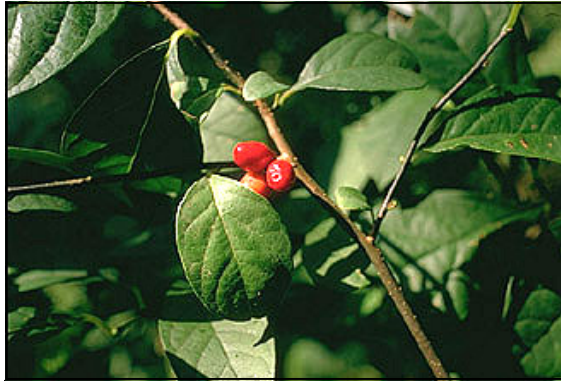
Spicebush fall berries.

Spicebush ( Lindera benzoin ) is appropriately named because its bruised leaves and stems have a spicy-sweet odor. It is also a splendid harbinger of spring; its branches studded with small, greenish-yellow flowers in early April. It will grow into a large, dense (6-12 feet high and wide) rounded shrub in full sun but it is somewhat open in appearance in the shade. The species is dioecious, and the female spicebush has bright, red fruit that ripen in September and October. The fruits remind me of the fruits of the Cornelian Cherry ( Cornus mas ). It has been reported that up to 30 species of birds enjoy spicebush berries. The regular harvesters of our bushes are mockingbirds and cardinals. We have had nesting catbirds and Brown Thrashers in this location so perhaps they enjoyed the fruit, also. In the fall, Spicebush contributes its brilliant yellow color to the wider autumn spectacle. Spicebush does best in acid, moist soils in full sun to partial shade. It is a wonderful wildlife habitat plant and