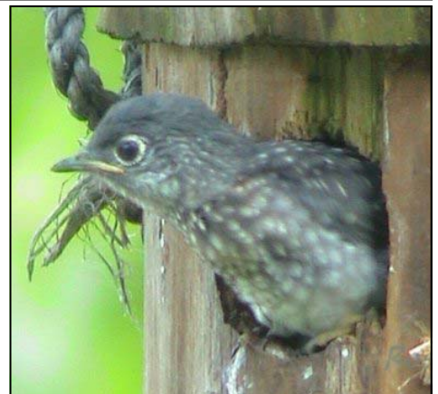
Baby Blue seconds before fledging.

The house wren numbers remained very low for two years, but now seem to be recovering. I was beginning to be concerned about their survival. I am annoyed when they build nests in 3 or 4 boxes and use only one, but I do enjoy watching and listening to them. We may be a part of their problem since we are locating nest boxes in open areas that especially favor bluebirds. It may be to save the house wrens we need to erect some boxes near tree and low shrubbery especially for them.